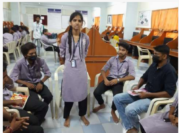
Topic: Traditional Computing Vs Cloud Computing