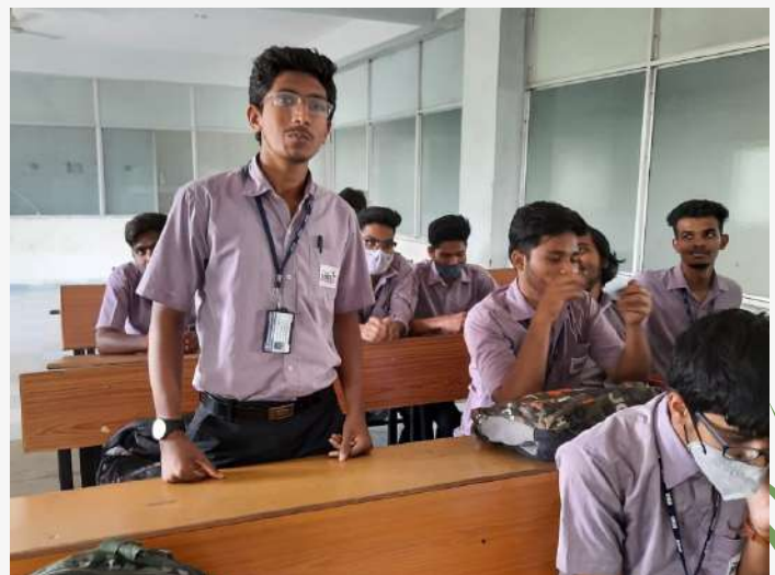
Topic: Technology is Boon or Bane