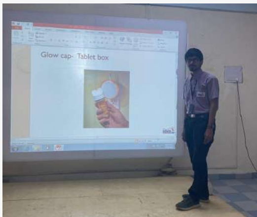
Seminar Presentation by IIIrd year CSE students.