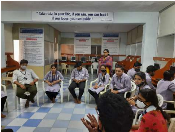
Topic: Online Classes Vs Offline Classes