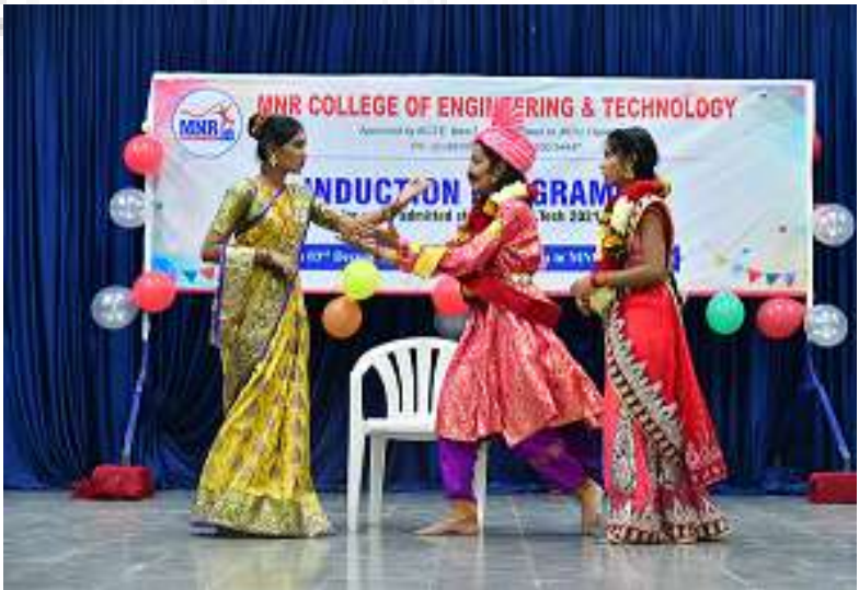
Skit by CSE 2nd 3rd and final years students