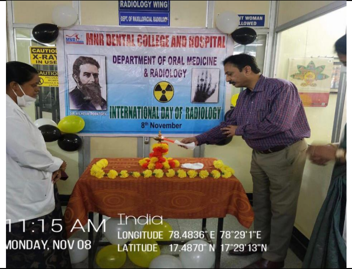
11:15 AM India MONDAY, NOV 08 LONGITUDE 78.4836° E 78°29'1"E LATITUDE 17.4870° N 17°29'13"N