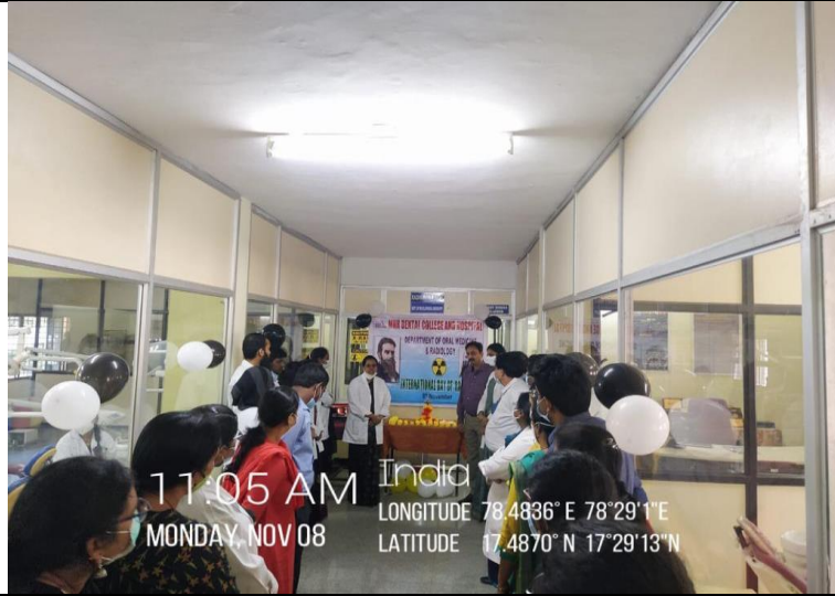
11:05 AM India MONDAY, NOV 08 LONGITUDE 78.4836° E 78°29'1"E LATITUDE 17.4870° N 17°29'13"N