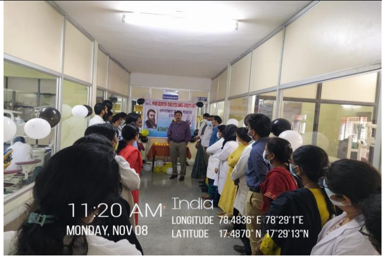
11:20 AM India MONDAY, NOV 08 LONGITUDE 78.4836° E 78°29'1"E LATITUDE 17.4870° N 17°29'13"N