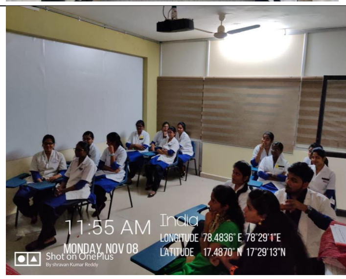
11:55 AM India MONDAY, NOV 08 LONGITUDE 78.4836° E 78°29'1"E LATITUDE 17.4870° N 17°29'13"N Shot on OnePlus