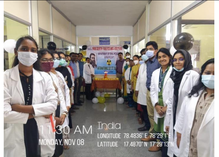
11:30 AM India MONDAY, NOV 08 LONGITUDE 78.4836° E 78°29'1"E LATITUDE 17.4870° N 17°29'13"N